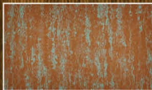
COPPER-TEN™ Raw SRI = 53 SR = .47 TE = .86