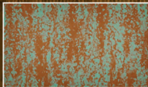
COPPER-TEN™ Robust SRI = 49 SR = .44 TE = .86