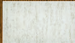
GALV-TEN™ Robust SRI = 78 SR = .65 TE = .87